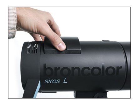
4. Switch the unit on at the main switch